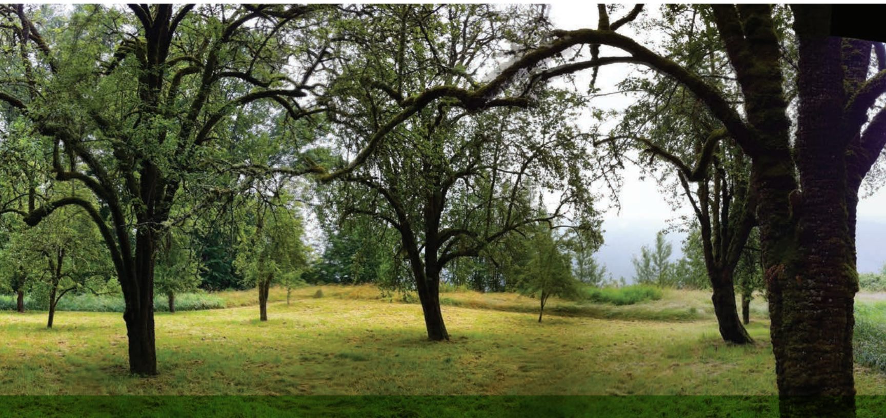
The Shire: John Yeon Preserve for Landscape Studies is a 75-acre waterfront site and designed landscape in the heart of the Columbia River Gorge. The Shire is owned by the State of Oregon for the use of the University of Oregon's School of Architecture and Allied Arts for educational and research purposes.