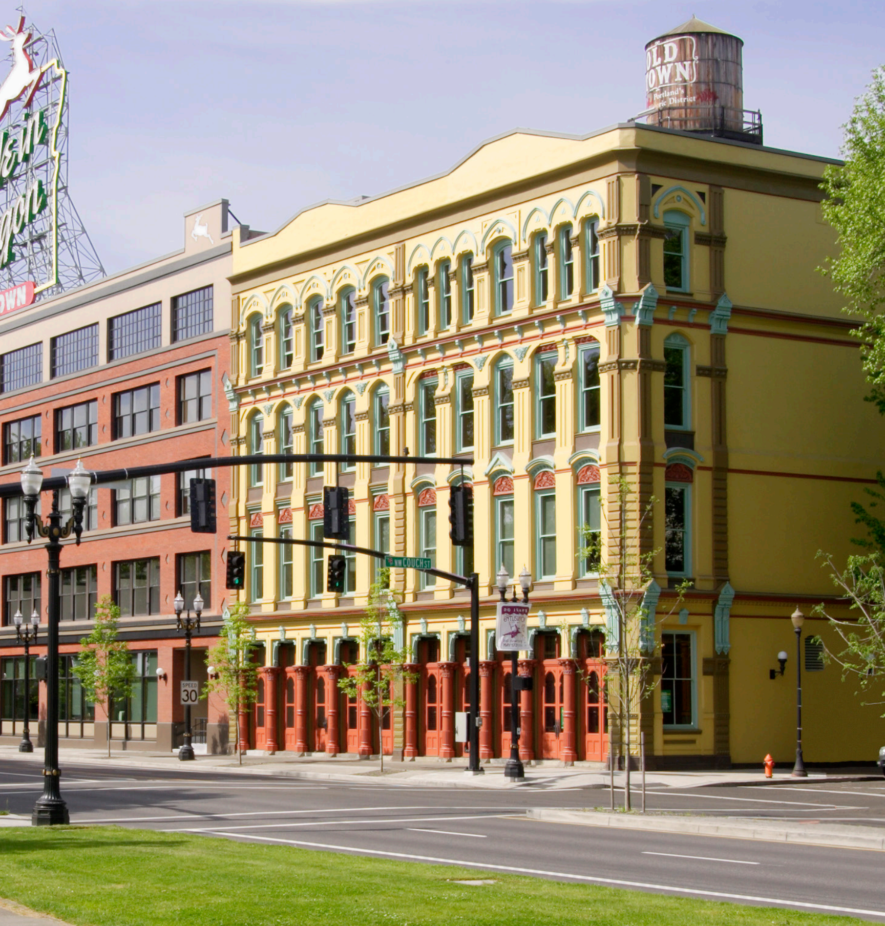
Above: White Stag Block, home of the University of Oregon in Portland.