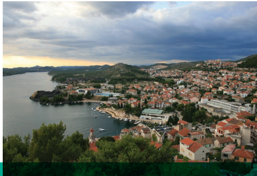
Left to right: Students measuring structures, Drvenik Veli, Croatia, Photo: Kingston Heath; Student at stone carving school, Island of Brač, Croatia, Photo: courtesy of UO; Sibenik, Croatia, Photo: Tim Askin.