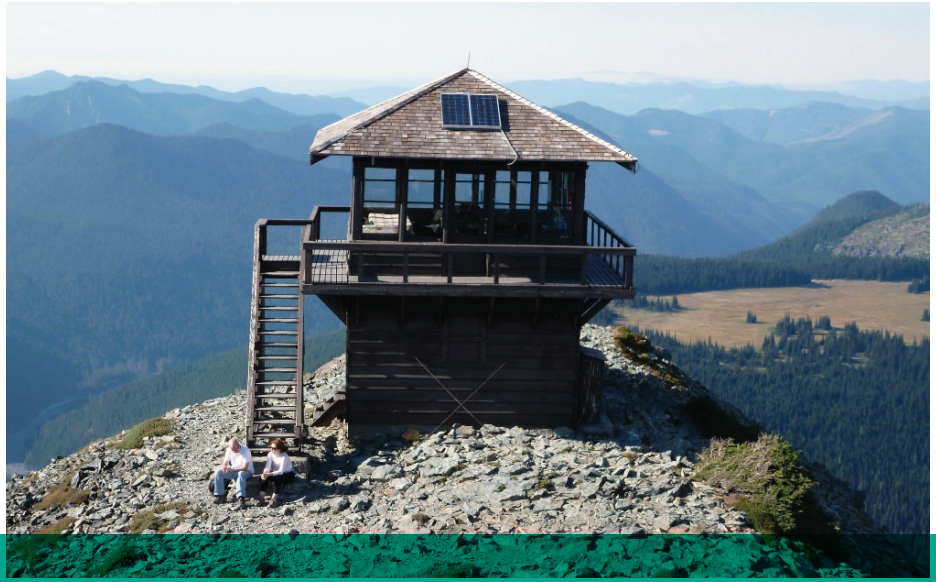
The 2016 Field School will be working at two cabins at Longmire Village, built in the 1930s, and also a fire lookout structure in Mount Rainier National Park in Washington. The National Park Service is celebrating its centennial in 2016. #FindYourPark