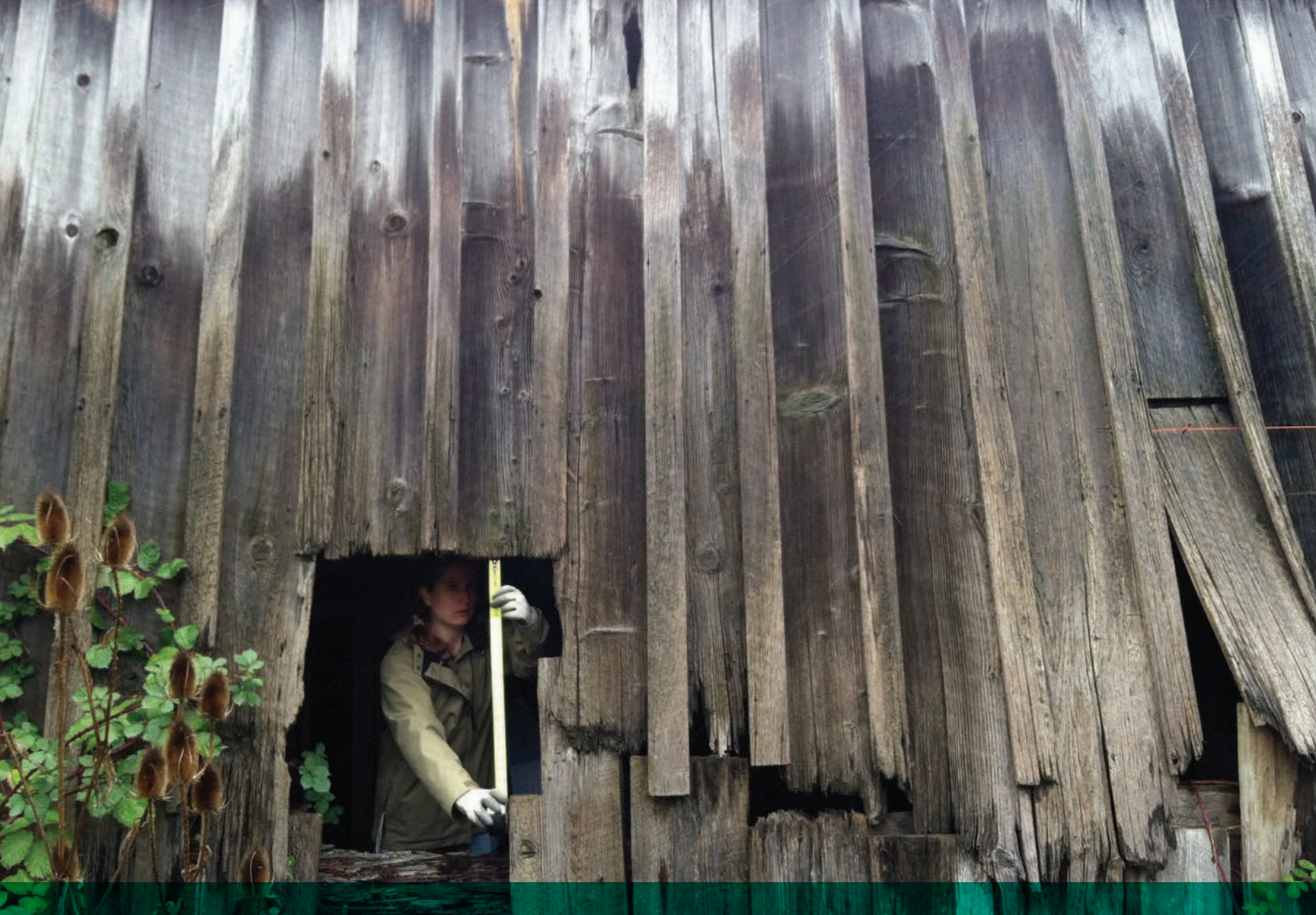
Historic Preservation Program graduate student measuring the Watson-Price Barn, Philomath, Oregon