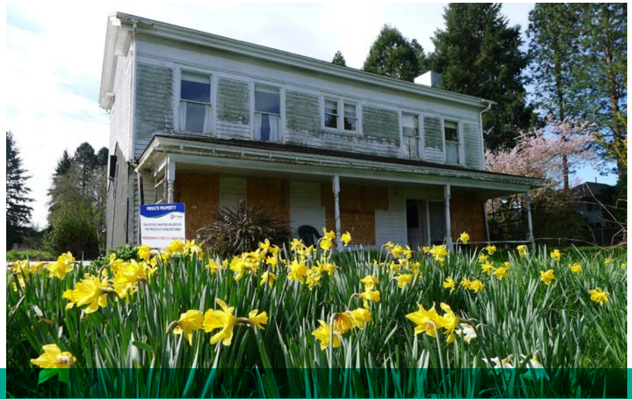
Left to right: The 2015 Pacific Northwest Preservation Field School will work on two historic structures—the Tryon Creek Cabin in Portland, Oregon, and the Masters House near Hillsboro, Oregon