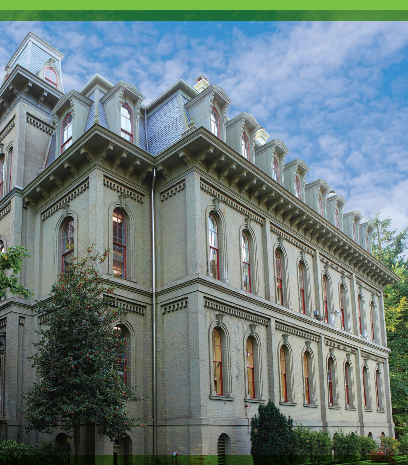
Above: Deady Hall, University of Oregon campus.