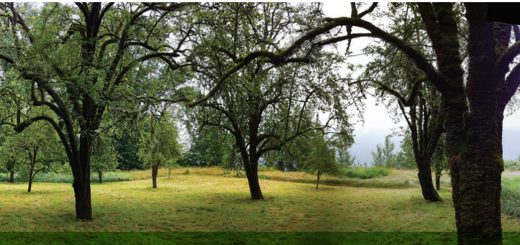
The Shire: John Yeon Preserve for Landscape Studies is a 75-acre waterfront site and designed landscape in the heart of the Columbia River Gorge. The Shire is owned and maintained by the State of Oregon for the use of the University of Oregon's School of Architecture and Allied Arts for educational and research purposes.