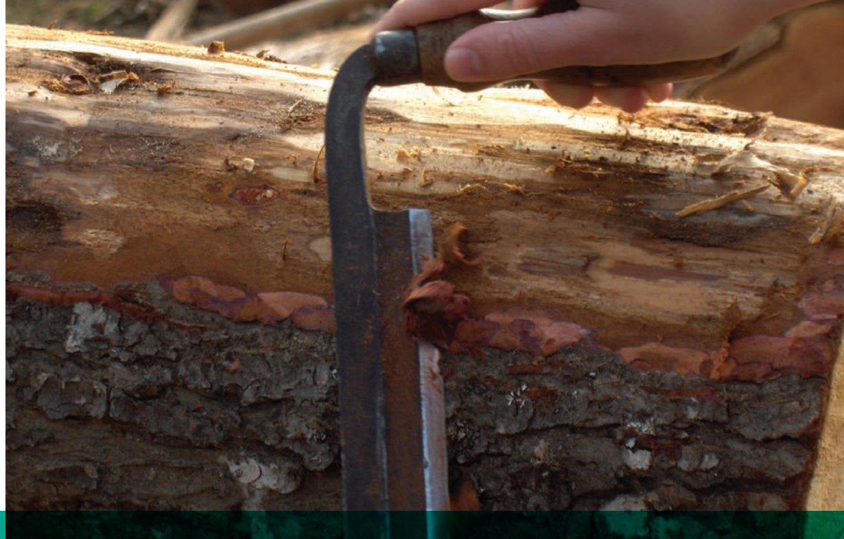
Left: Masonry detail; Center: Comstock Barn at Ebey's Landing National Historical Preserve on Whidbey Island, Washington, Photo: Courtesy of PNWFS, Right: Using a draw-knife to prepare a log, Olympic National Park. Photo: Courtesy of PNWFS.

preservation portion of your degree plan, is available on the website: hp.uoregon.edu/resources/forms . Students should work closely with their advisers and the Graduate School to ensure that all requirements are met in a timely manner.