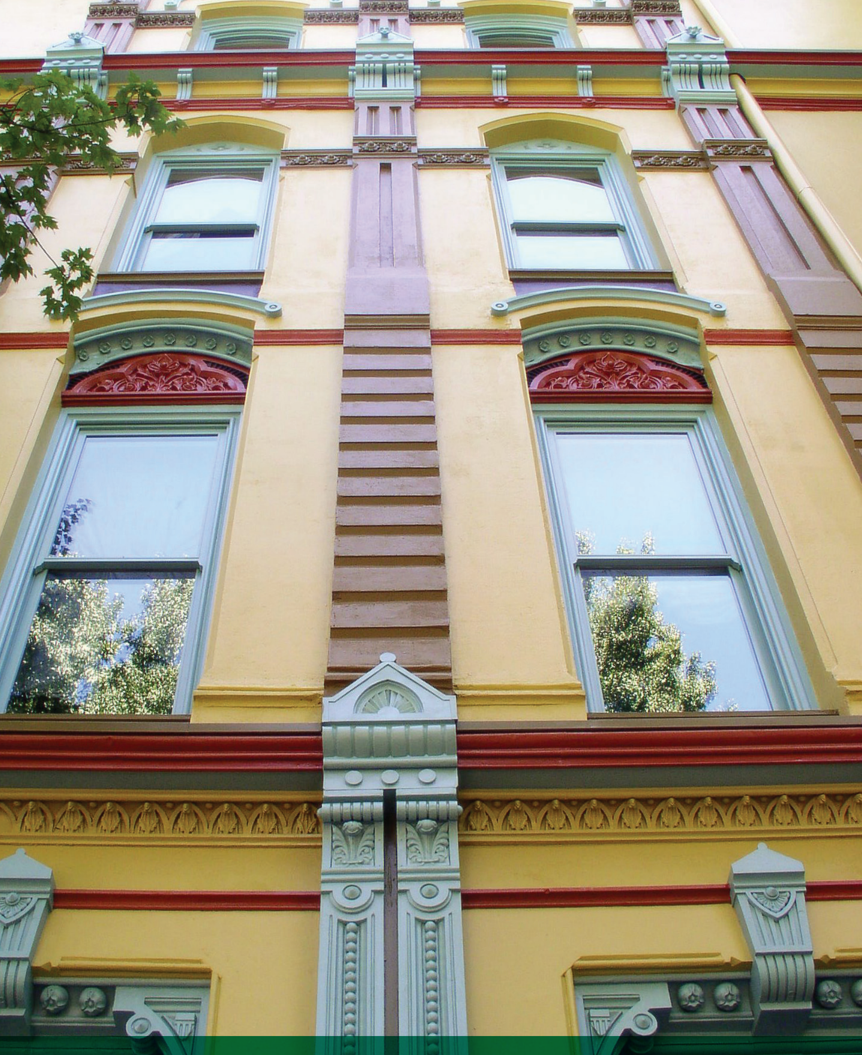
Above: White Stag Block, Portland Oregon.