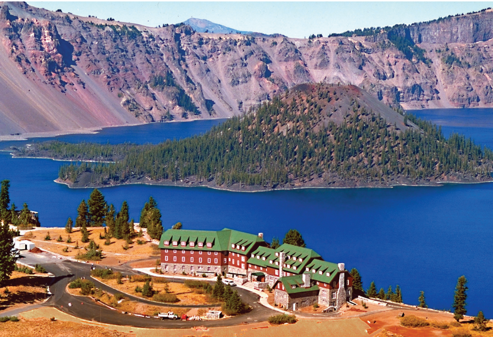
Crater Lake Lodge, Crater Lake National Park, Oregon, opened in 1915, and had extensive renovations in 1995. The work restored its historic character and preserved the classic architecture design for future generations.

Note: This is not an exhaustive list of all available courses. If participating departments offer other courses that apply to the historic preservation field of study, the program will address the course's eligibility to count toward these areas in the term offered.