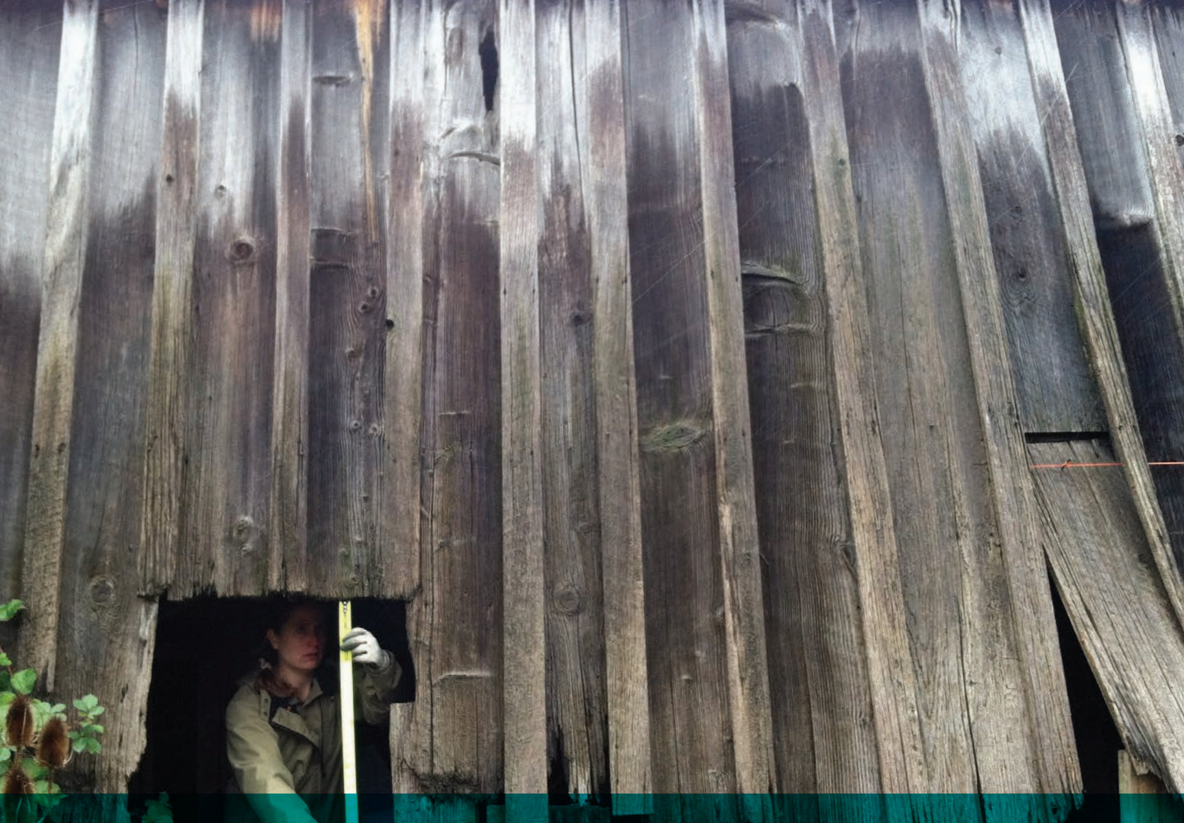
Historic Preservation Program graduate student measuring the Watson-Price Barn, Philomath, Oregon