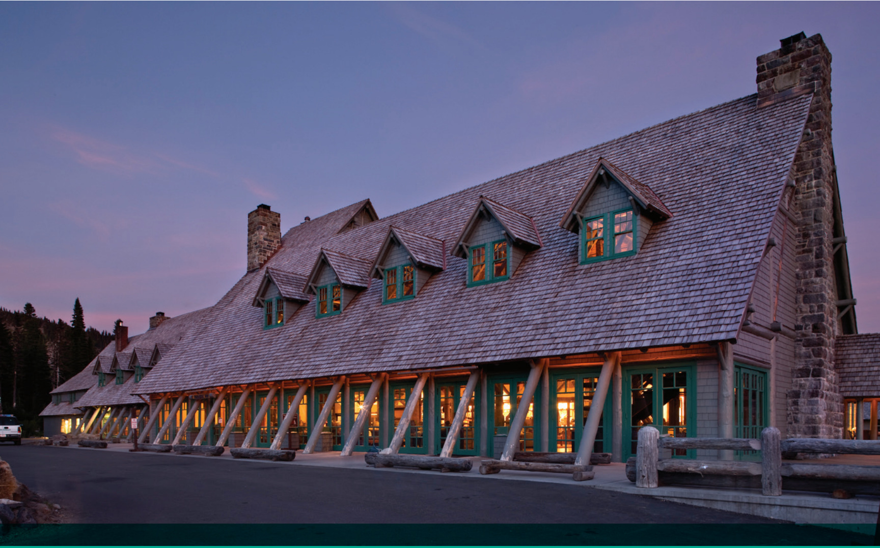
Paradise Inn, Mount Rainier National Park, Washington, built in 1916, is recognized as one of the great lodges of the West. Rehabilitation work, including structural and accessibility upgrades, was completed in 2008.

UNIVERSITY OF OREGON School of Architecture and Allied Arts