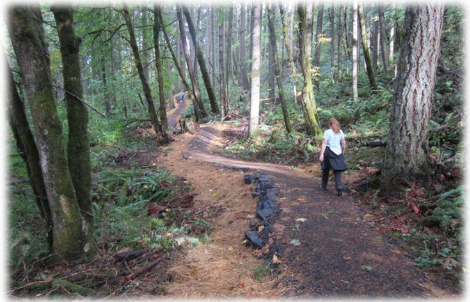
The Dillard Connector Trail is the newest addition to the Ridgeline Trail system.

understanding of the constraints and opportunities presented by our local landscape and land use patterns. Students will then select an individual trail corridor to focus on for the remainder of the studio. Initial assignments will include site analysis of individual study areas, development of trail siting and design criteria, and development of several trail alignment alternatives which will be presented at midterm for feedback. During the second half of the term, students will refine their potential corridors and then develop and apply an assessment methodology. Based on the results of the assessment, a single trail proposal will be selected and refined. Final work will include a detailed proposal for trail alignment, trail amenities, access to points of interest, local access points, parking, integration of signage and art, and land acquisition needs. We will use diagrams, photo imaging, sketches, etc. to make our proposed trails come to life and represent what a future trail user might experience as they move along your trail.