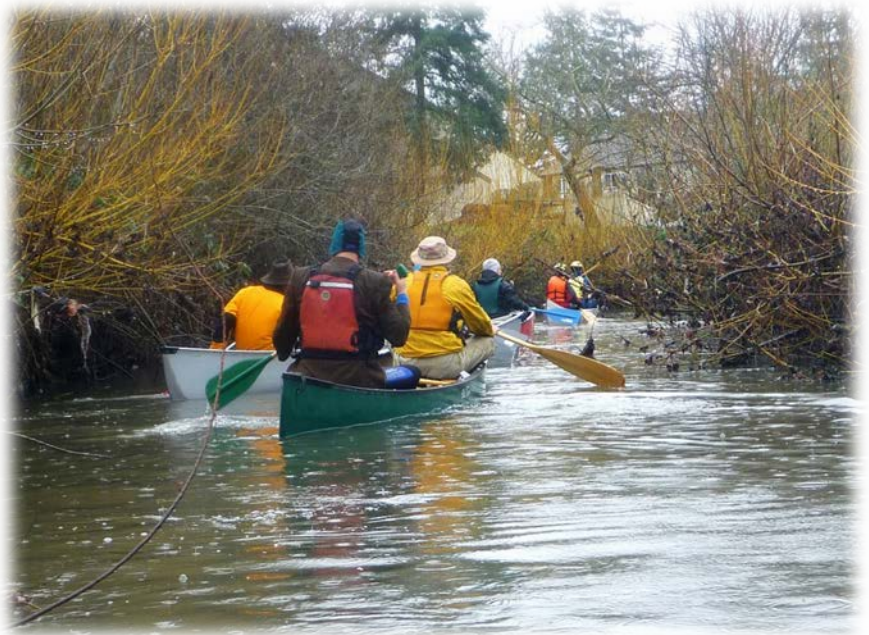
Could an Amazon Creek Water Trail be a reality?