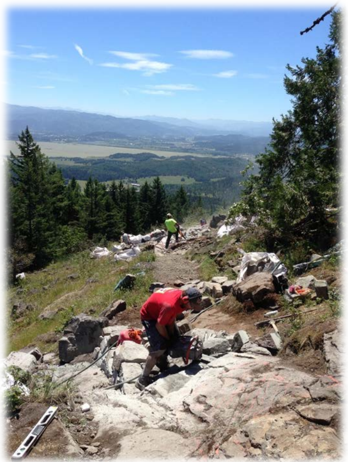
Trail construction near the summit of Spencer Butte (2015)

The ETP proposes a number of general trail corridors that are still highly conceptual (point A to point B) and developing siting and design options for these specific corridors will be the focus of this studio. We will work