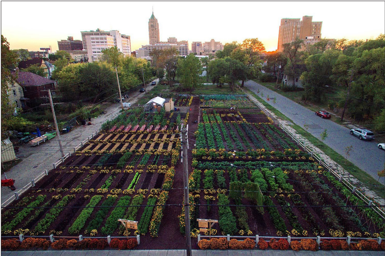
MUFI: Michigan Urban Farming Initiative Garden