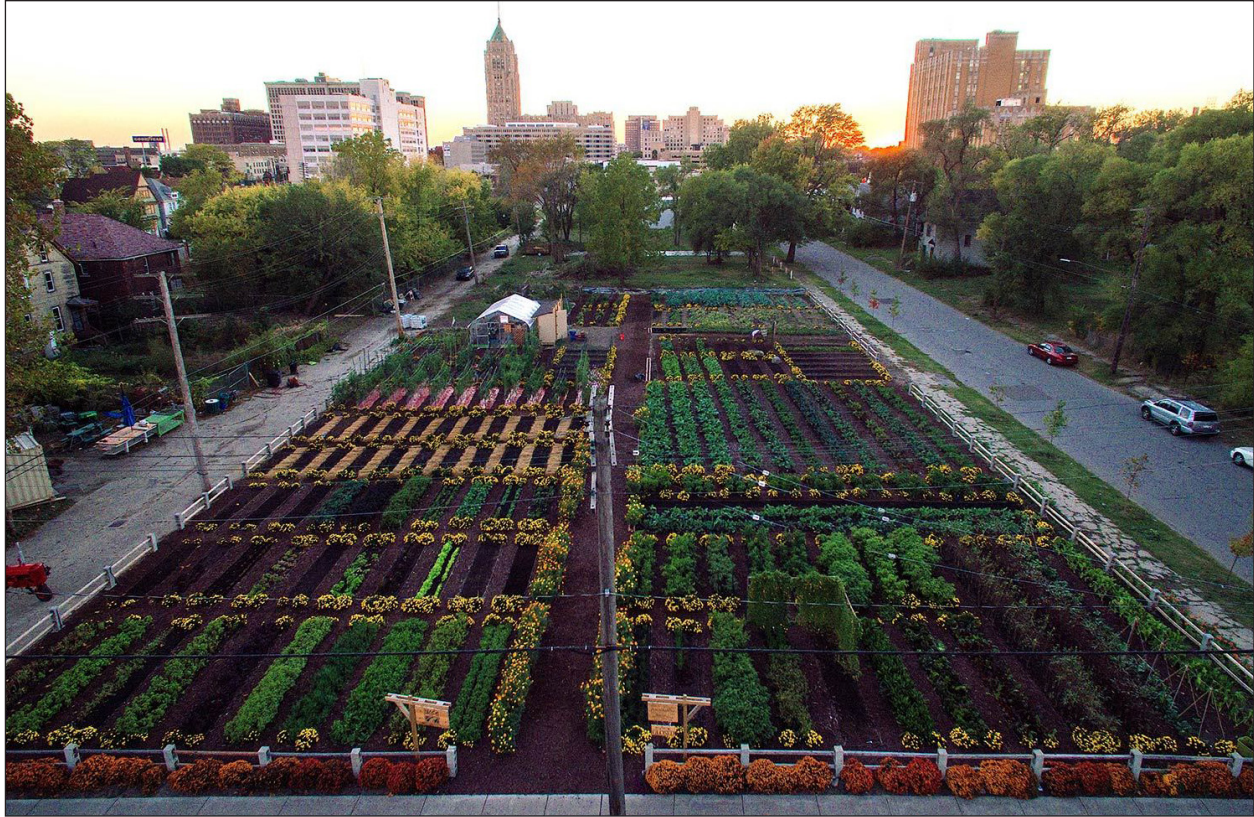
MUFI: Michigan Urban Farming Initiative Garden