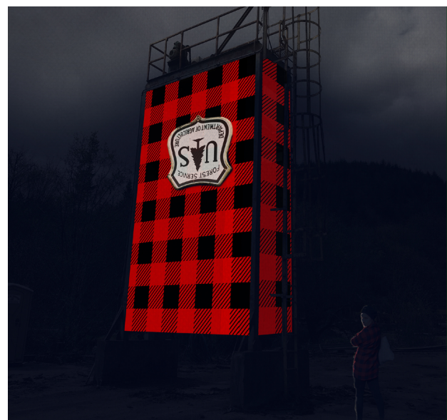
HJA Design Research Drawings by DBB: Context map, inventory diagram as stakeholder research tool (top), and sci-comm installation concept drawing as community outreach (bottom).