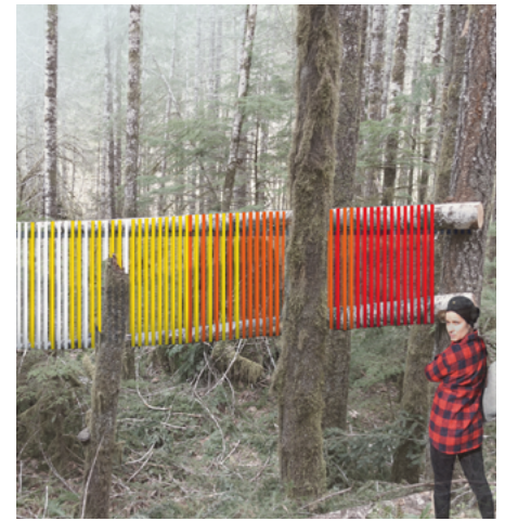
HJA Design Research Drawings by DBB: Context map, inventory diagram as stakeholder research tool, and sci-comm installation concept drawing as community outreach (left to right).