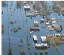
Climate Resilience and Advocacy