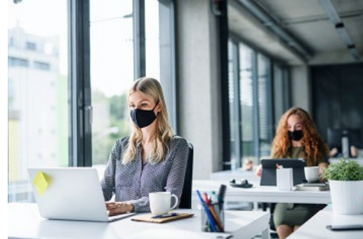
It starts with You, soon

So, you think you are ready to jump out into the world and practice landscape architecture? Do you have a dream job in mind, or an interest in running your own practice? This is where you start. Welcome to LA 462/ 562! To this point in your education, you have learned a great deal about design and the art and science of being a designer. However, precious little is ever discussed about the business of design, whether it is in private practice, a non-profit or the public sector. Through weekly guest speakers from around the country, we will explore the complexities of the profession of landscape architecture- from business formation to ethics and legal issues, licensure, accounting, marketing and promotion, hiring practices, mentors, path to Principal, office culture and whatever else we can think up.