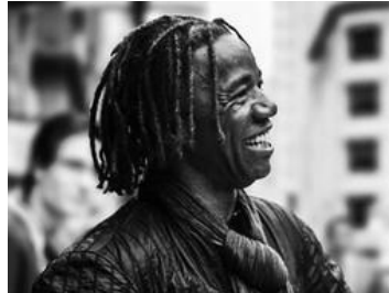
Walter Hood-Hood Studio